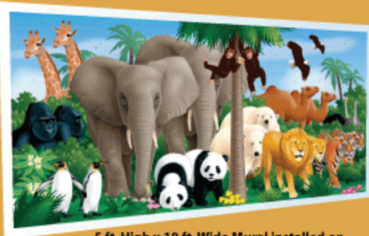
5 ft. High x 10 ft. Wide Mural installed on painted sheetrock